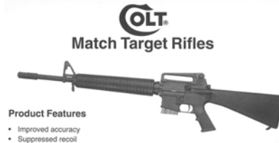
AR-15 Assault Rifle, Post-Ban (MatchTarget)