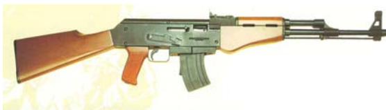
AK-47 Assault Rifle, Pre-Ban