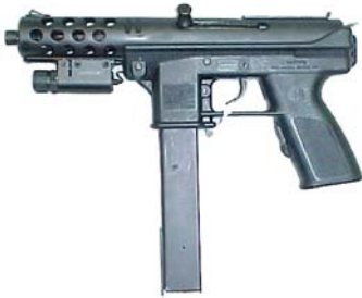
TEC-9 Assault Pistol, Pre-Ban