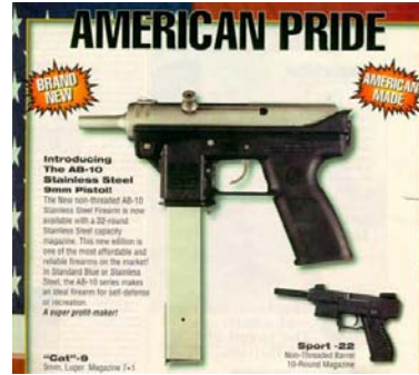
TEC-9 Assault Pistol, Post-Ban (AB-10)