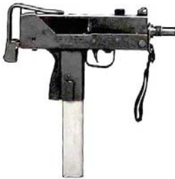
MAC-10 Assault Pistol, Pre-Ban