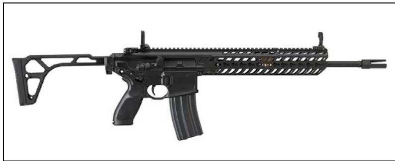
STG-44 on top, Sig Sauer MCX on bottom

Deadly designs. One thing leaps out from the pictures above: the remarkable similarity of the first assault rifle to the Sig Sauer MCX and other assault rifles currently being marketed by gunmakers. This family resemblance is not a coincidence. From the STG-44 “storm gun” to the MCX “true mission-adaptable weapon system,” assault weapons have incorporated into their design specific features that enable shooters to spray a large number of bullets over a broad killing zone, without having to aim at each individual target. These features not only give assault weapons a distinctive appearance, they make it easy to simply point the gun while rapidly pulling