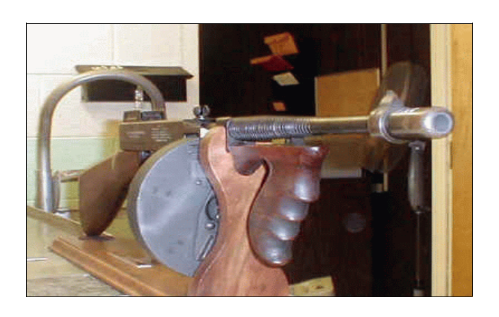
John Dillinger's 1921 Colt Thompson

The National Firearms Act of 1934 (NFA) was the first major federal statute to regulate firearms, including machine guns. The 1934 law was Congress' response to the wave of gun violence precipitated by Prohibition and the notorious interstate robbery sprees of criminals such as John Dillinger. Congress heard ample evidence