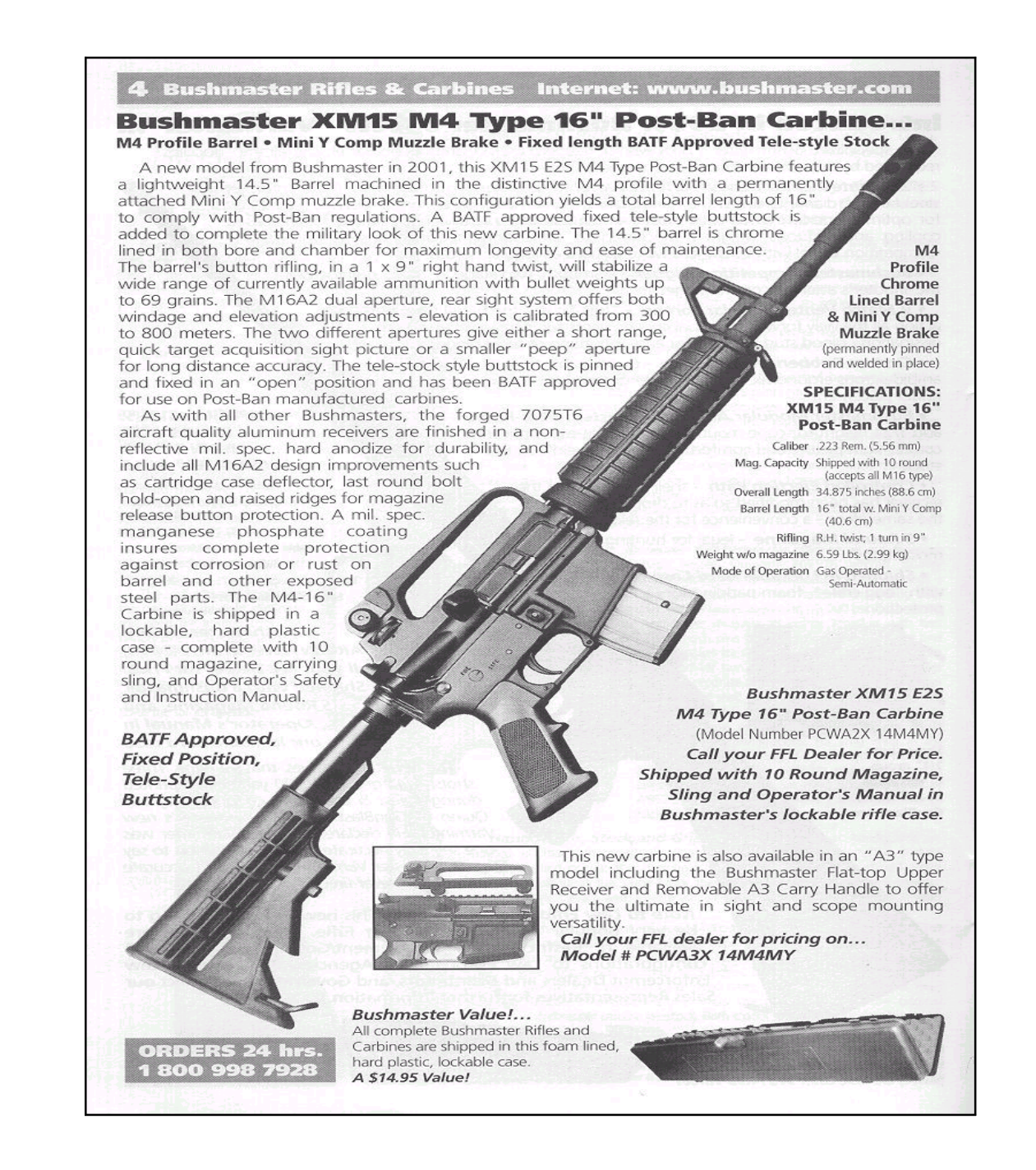
The Bushmaster XM15 used by the Washington, DC-area snipers to kill 10 and wound three in October 2002 is the poster child for the gun industry's cynical efforts to circumvent the federal assault weapons ban. Maine-based Bushmaster even advertises the gun—based on the banned Colt AR-15 assault rifle—as a "Post-Ban Carbine."