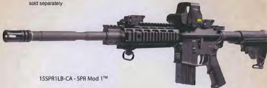
15SPR1LB-CA - SPR Mod 1™

ArmaLite® is known for its history of innovation. Its Special Purpose Rifle (SPR®) has proved it for years. Now, the introduction of the ArmaLite SPR Mod 1™ proves it once more, in spectacular fashion. The SPR Mod 1 is a forged, one-piece upper receiver/rail system with exclusive detachable side and bottom rails.