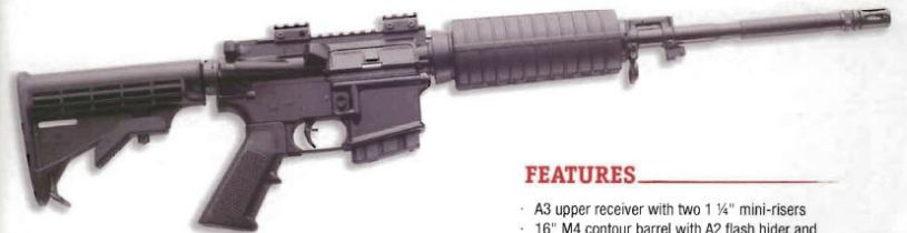
Bullet Button M4 Type ORC (90888)