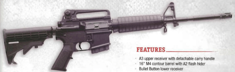
Bullet Button Patrolman's Carbine (90880)