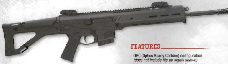
Bullet Button ORC ACR® (90893)