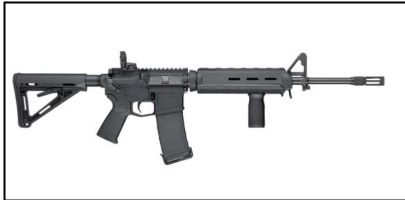
STG-44 above, S&W MP15 below

Deadly designs. One thing leaps out from the pictures above: the remarkable similarity of the first assault rifle to the Smith & Wesson M&P15 and other assault rifles currently flooding America’s streets. This family resemblance is not a coincidence. From the STG-44 “storm gun” to the M&P15 “tactical rifle,” assault weapons have incorporated into their design specific features that enable shooters to spray (“hose down”) a large