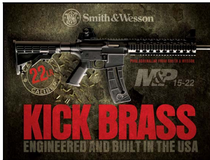
Smith & Wesson introduced its M&P15-22 in 2009

The money continued to roll in. On July 20, 2009—exactly three years to the day before the Aurora mass murder—Golden stated in an interview that a "category that has been extremely hot is tactical rifles, AR style tactical rifles." 9 On a June 2009 investors conference call, Golden enthused that "tactical rifles were up almost 200% versus the same period the year before. We have increased our capacity on that rifle." 10 The company was doing so well with its assault rifles that it decided to introduce a new variant in 22 caliber because the ammunition is much cheaper than the military-style ammunition used in the M&P15. "We have an M&P15 that shoots .223 ammo that sells extremely well," Golden said. "We have just launched an AR-style rifle that shoots .22 caliber rounds that we think will be extremely popular because of the price of ammo." 11